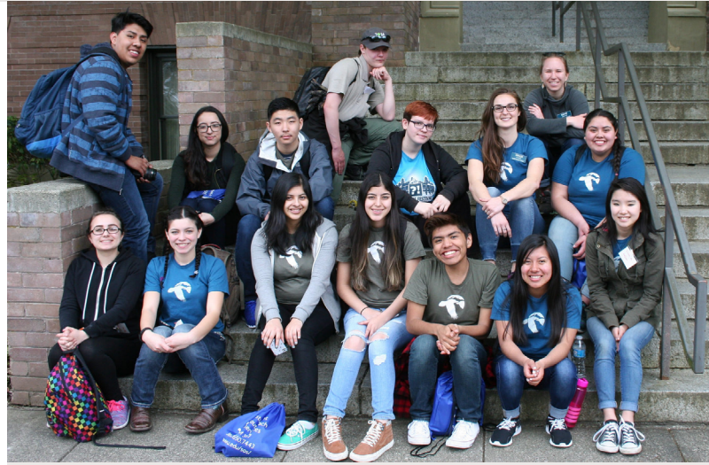
2017 Youth Ambassadors on a camups tour of Western Washington University

We worked on environmental stewardship both internally and externally in 2017. An internal sustainability report examined how we use electricity, fossil fuels, materials and supplies, and Seattle City Light conducted an energy audit of the Learning Center campus. We enacted about half of