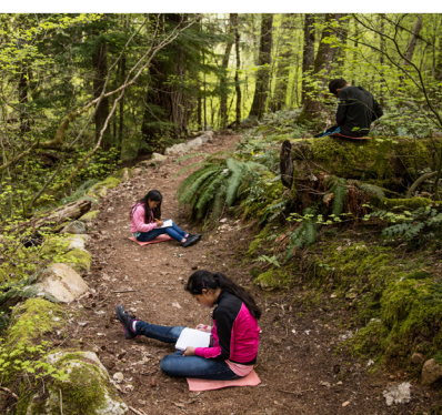
INSPIRATION to continue learning and connecting with public lands and the natural world

KNOWLEDGE of the North Cascades ecosystems and the SCIENTIFIC PROCESS