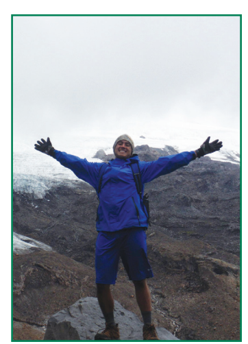
Volunteerism & Empowerment