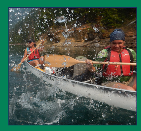
Hearing the positive comments about my leading was a definite confidence boost. I believe that with time, effort and dedication I can make a huge difference.