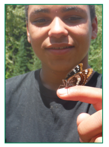
Ecological Literacy & Field Science