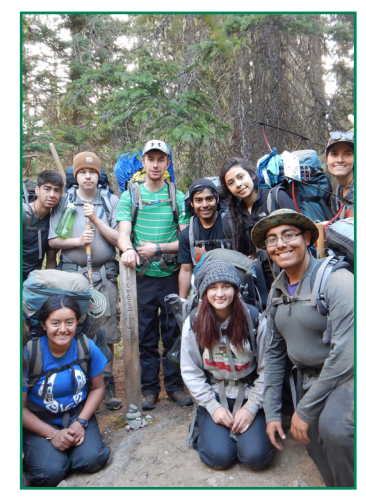
Sense of Place & Community