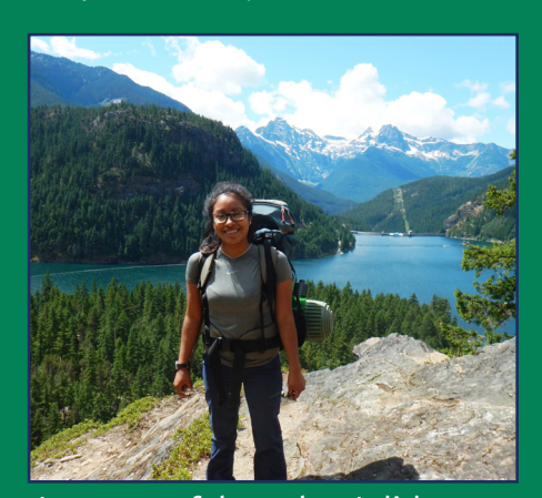
I saw proof that what I did matters. One of my instructors showed me a spot where plants had grown after she had rehabilitated the area many years ago.