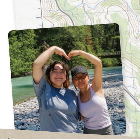
leaders, activists, and friends