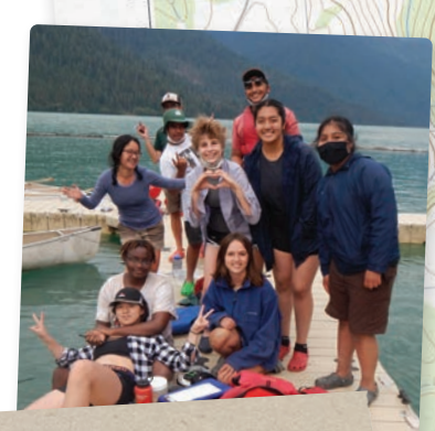
laughter, joy and a sense of community