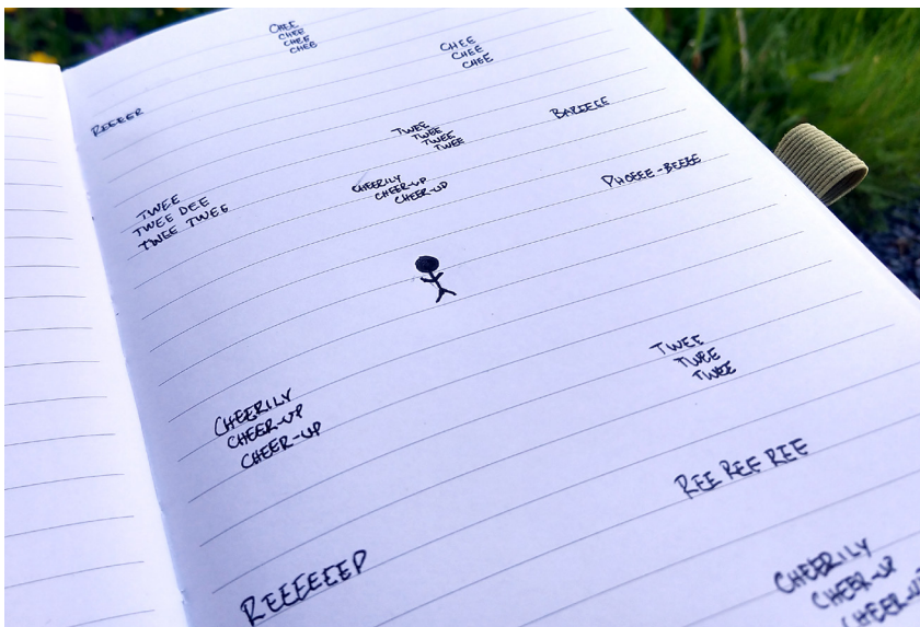
Here is a sound map, detailing bird calls and their locations around the listener.

A great way to start identifying bird calls is to do a Sit Spot—sit quietly in an outdoor spot for 10 minutes while listening to the sounds around you. Check out Mountain School @ Home Lesson 1 for more on Sit Spots. As you sit and listen, record the bird sounds around you on a sound map. Using a sheet of paper (or the space provided on reverse) mark yourself in the center and record the sounds that you hear as they are in relation to you. Writing down the calls as if they were sounded out words will help you remember what you heard. If many birds are calling, focus on writing an accurate representation of the sounds rather than recording every call that you hear.