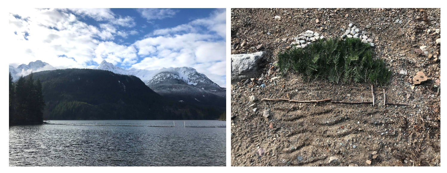
▶ Here is an example of a landscape of Diablo Lake and the surrounding mountains, made using nature items: white rocks for Colonial and Pyramid Peaks, fir needles for the hillside, sticks for the boom, and wavy lines drawn in the dirt for the water.

ART CHALLENGE: Take a minute to sketch the landscape you are looking at. It doesn't have to be perfect, just give it your best effort! If you don't feel excited about drawing, try to create a representation of your landscape using various items found in nature (sticks, leaves, fir cones, etc.). Try to include the features as you noted above.