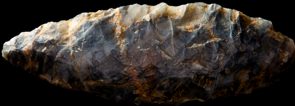
SPEAR POINT MADE OF HOZOMEEN CHERT FROM CASCADE PASS