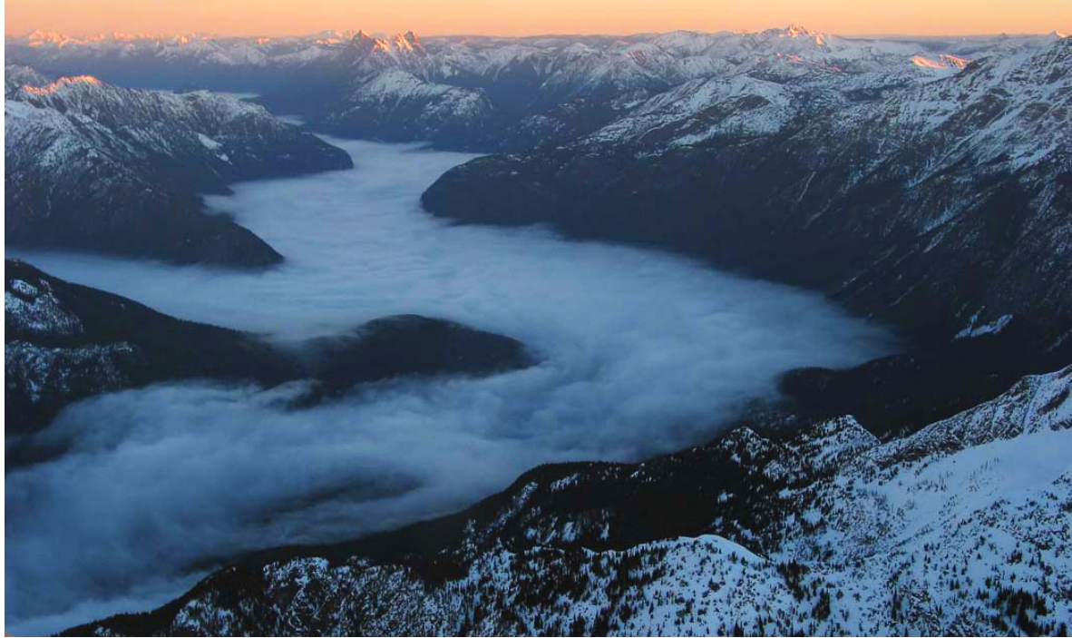
ROSS LAKE AT SUNRISE