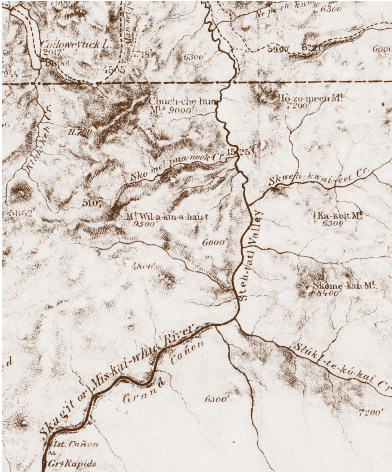
U.S. NORTH WEST BOUNDARY SURVEY, MAP OF WESTERN SECTION, PUBLISHED 1866