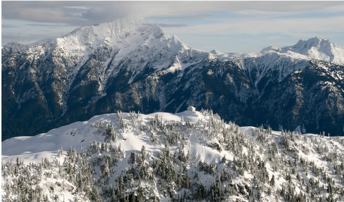
JACK MOUNTAIN AND SOURDOUGH LOOKOUT PHOTOGRAPHED IN WINTER BY JOHN SCURLOCK