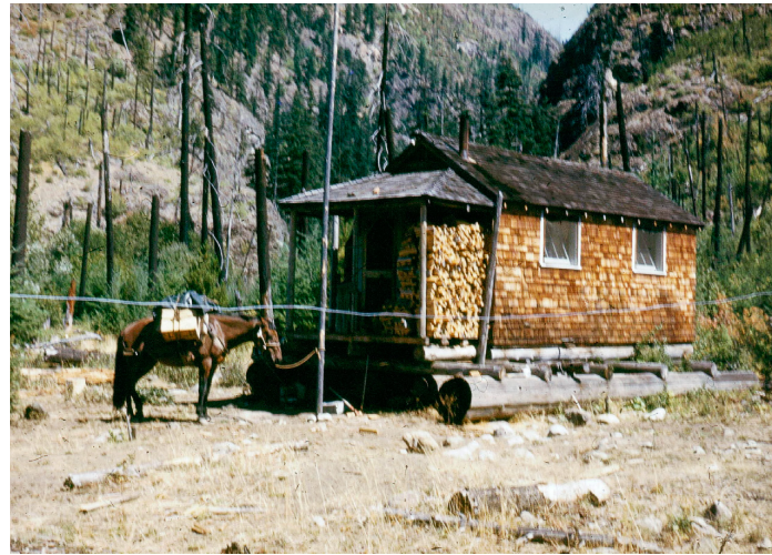
1961 PHOTO OF LIGHTNING CREEK GUARD STATION

The first written record of the upper Skagit valley is from Henry Custer's 1859 boundary survey explorations. Guided by knowledgeable Fraser River Indian guides, and traveling in a dugout canoe specially built for this trip near today's Hozomeen, they followed the river all the way to the mouth of Ruby Creek. It was an amazing trip of discovery, interrupted in places by huge log jams requiring them to portage before they could continue. Near today's Cougar Island the river entered a narrow,